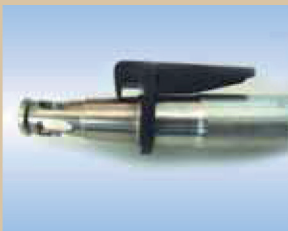
Filling nozzle, Flex Inflator, aluminium, 80 mm with click-on, item no. .... 096240