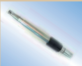
Filling nozzle, Flex Inflator, aluminium, 150 mm with air-release, item no. .... 096128