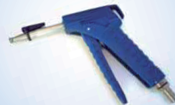
Bates Flex Inflator with click-on, item no. 096248