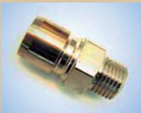
Male coupling for Standard/Flex Inflator and Quick Inflator (fitted on the inflator for quick change between different inflators), item no. .... 096069