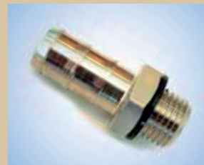
3/8" hose connector for Standard Inflator, item no. .... 096057