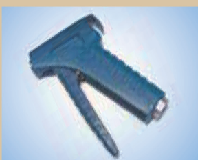
Handle for Inflator, item no. .... 096060