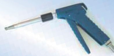
Bates Flex Inflator with 150 mm pipe and air-release, item no. 096059