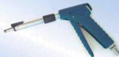
Bates Flex Inflator with click-on and air-release, item no. 096259