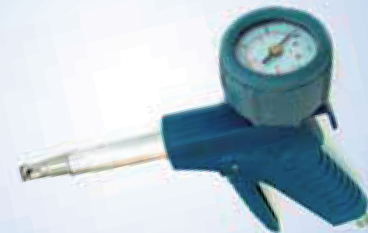
Bates Flex Inflator with Ø40 mm manometer, item no. 096049