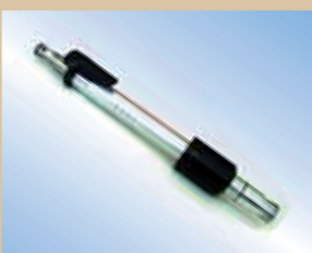
Filling nozzle, Flex Inflator, aluminium, 150 mm with click-on and air-release, item no. .... 096228