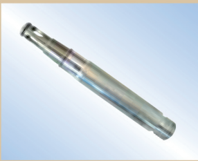
Filling nozzle, Flex Inflator, aluminium, 80 mm, item no. .... 096040