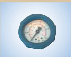
Manometer with protective casing (Ø40 mm – scale 0-2,5 bar), item no. .... 096053