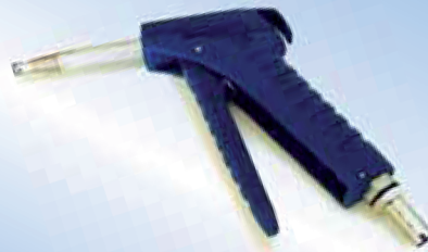
Bates Flex Inflator with 80 mm pipe, item no. 096048

Click-on: Bates Flex Inflator is available with a click-on system. The advantage of the click-on is that it is possible to lock the inflator to the airbag, so you can inflate the airbag using just one hand. After inflation the inflator is released by a small push on the "lock".