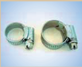
1/2" clip item no. .... 096036 3/8" clip item no. .... 096033