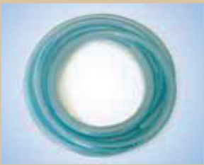
1/2" hose (50 m) item no. .... 096035